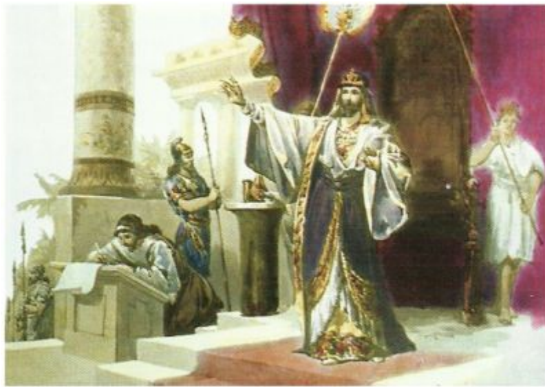
Proclamation of king Cyrus

Cyrus issued a edict according to the order of God given about 200 years earlier (Isa. 44:28). The word "Cyrus" means the "Sun." So Cyrus represents Christ, the Sun of Justice, which will build New Jeruzalem, true Church (Eph. 5:27; Rev. 21:9, 10).